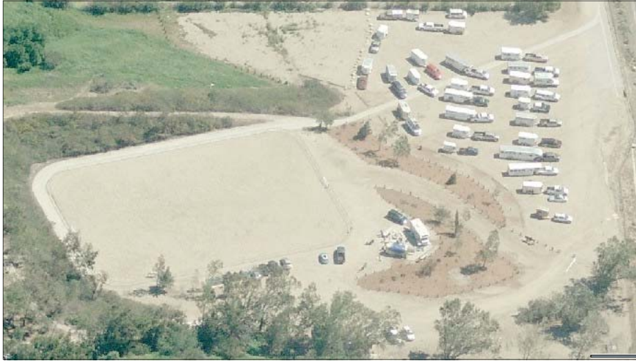
Kris Minzey found this cool picture of Stetson Ranch Equestrian Center dated in 2008. She thinks it was probably taken during the time of our Trail Trials.